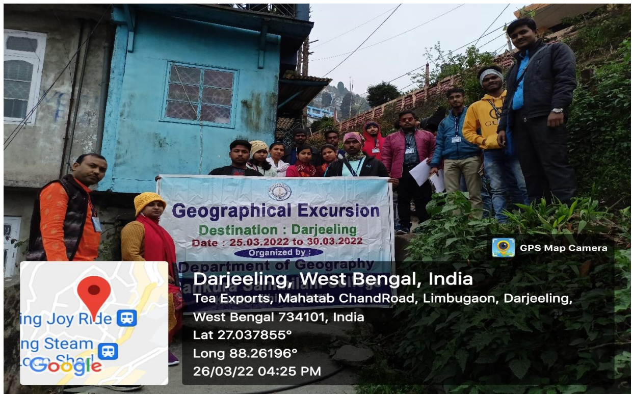
Field Survey at Darjeeling, 2021-22