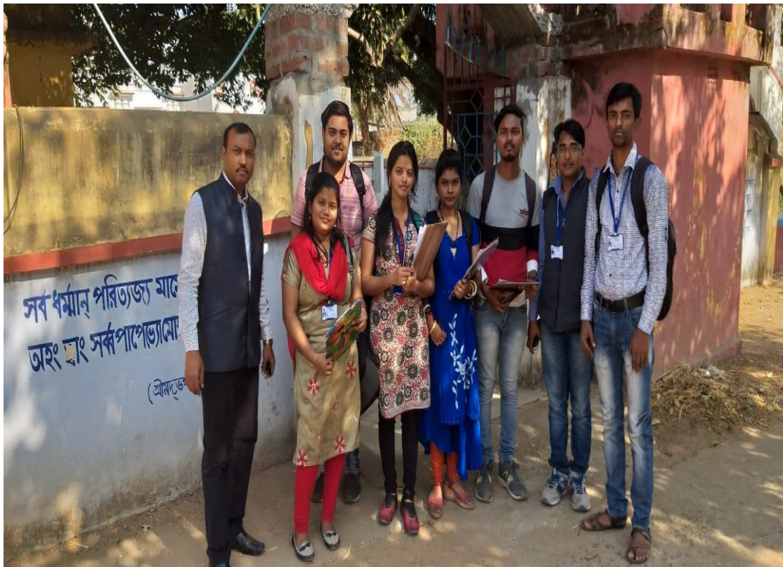
Field Survey at Nandigram, Bankura, 2018-19